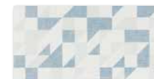
WADMB455 ○ 74 | m 2 matlesk | mattglossy | V4