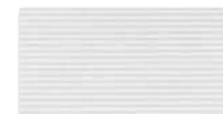
WADMB458 ○ 74 | m 2 matlesk | mattglossy