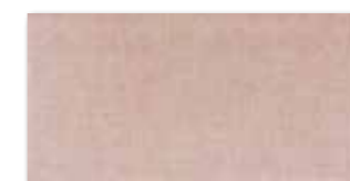
WADMB451 ○ 68 | m 2 matlesk | mattglossy