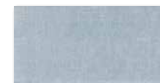
WADMB452 ○ 68 | m 2 matlesk | mattglossy