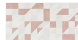
WADMB454 ○ 74 | m 2 matlesk | mattglossy | V4