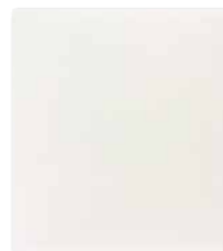
DAA44050 PEI 4 ○ 74 | m 2 mat | matt