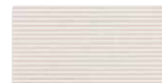
WADMB457 ○ 74 | m 2 matlesk | mattglossy