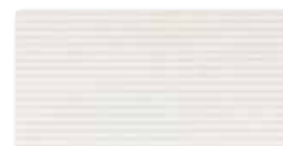
WADMB456 ○ 74 | m 2 matlesk | mattglossy